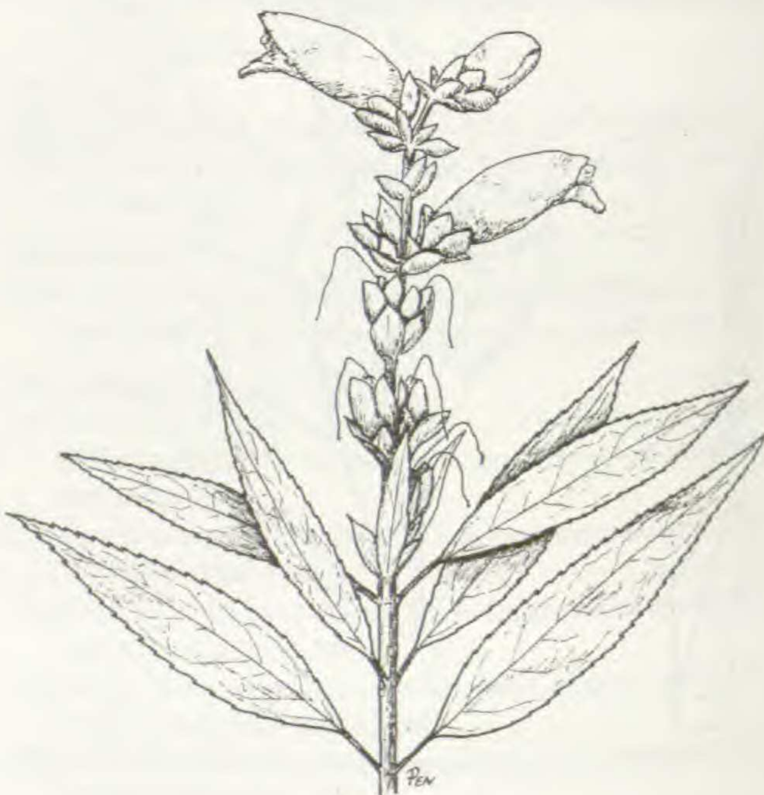
FIG. 9. Chelone glabra .